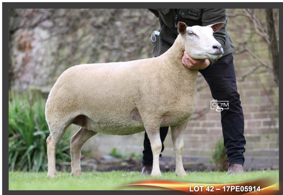
LOT 42 – 17PE05914