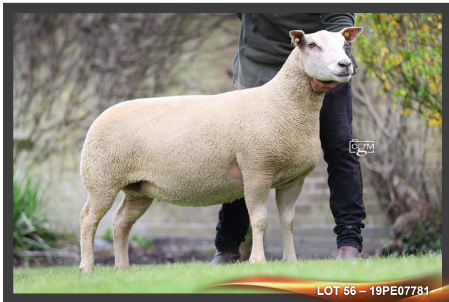
LOT 56 – 19PE07781