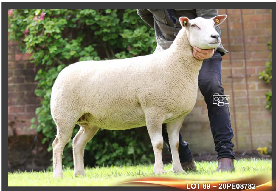
LOT 89 – 20PE08782