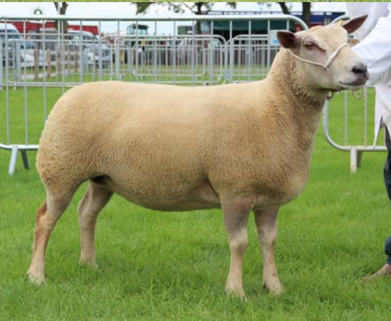
DALBY OPRAH - 14PE03073