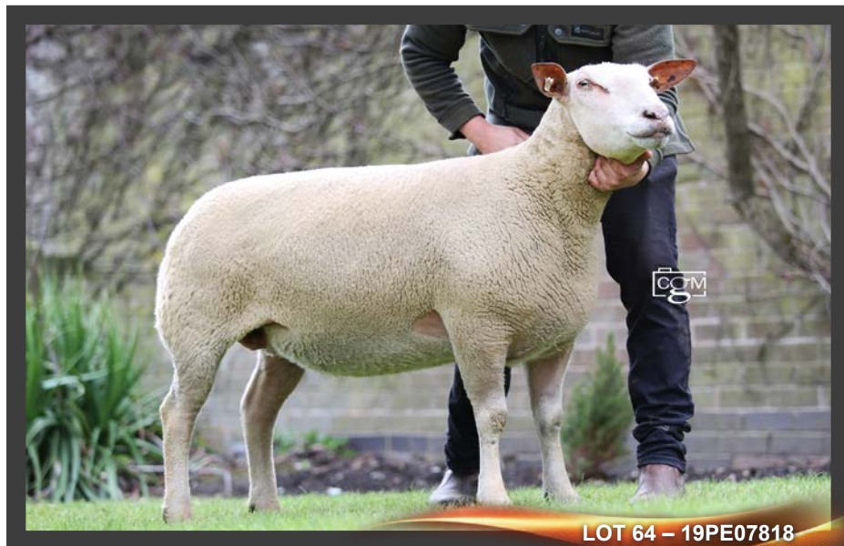
LOT 64 – 19PE07818