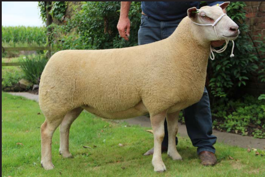
DALBY RHAPSODY - 16PE04979

SIX DAUGHTERS OF THE LEGENDARY DALBY RHAPSODY SELL IN THE SALE