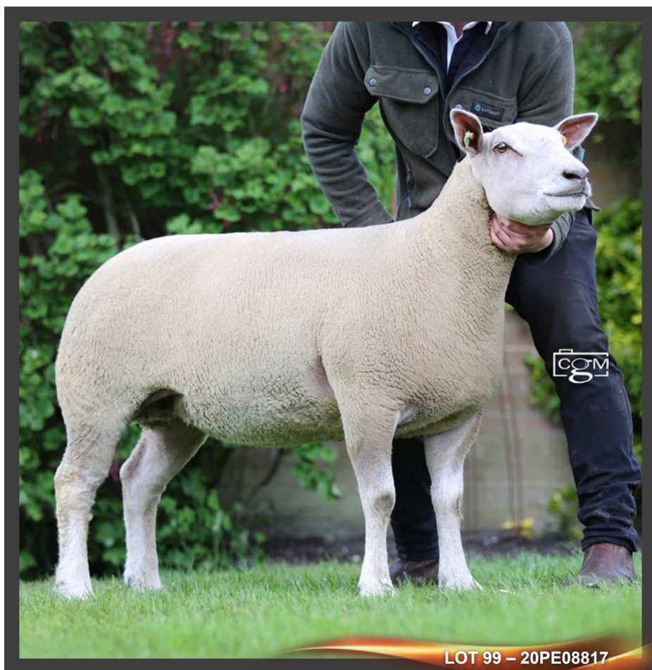
LOT 99 - 20PE08817