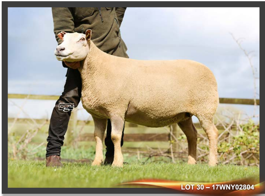
LOT 30 – 17WNY02804