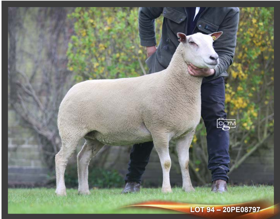
LOT 94 - 20PE08797