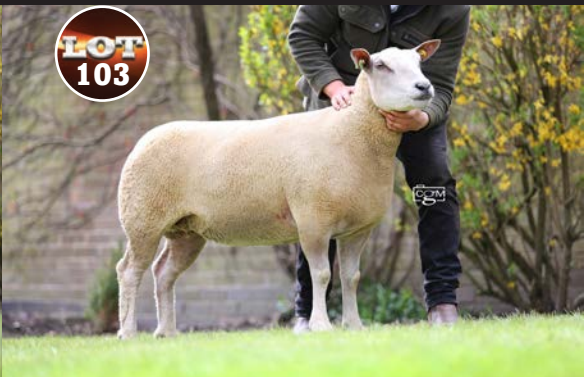
LOT 103 - 20PE08835