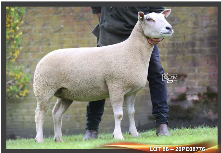
LOT 86 – 20PE08776