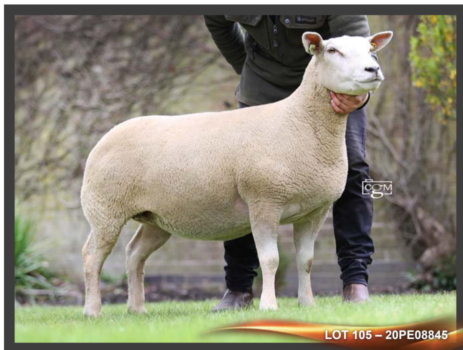
LOT 105 – 20PE08845