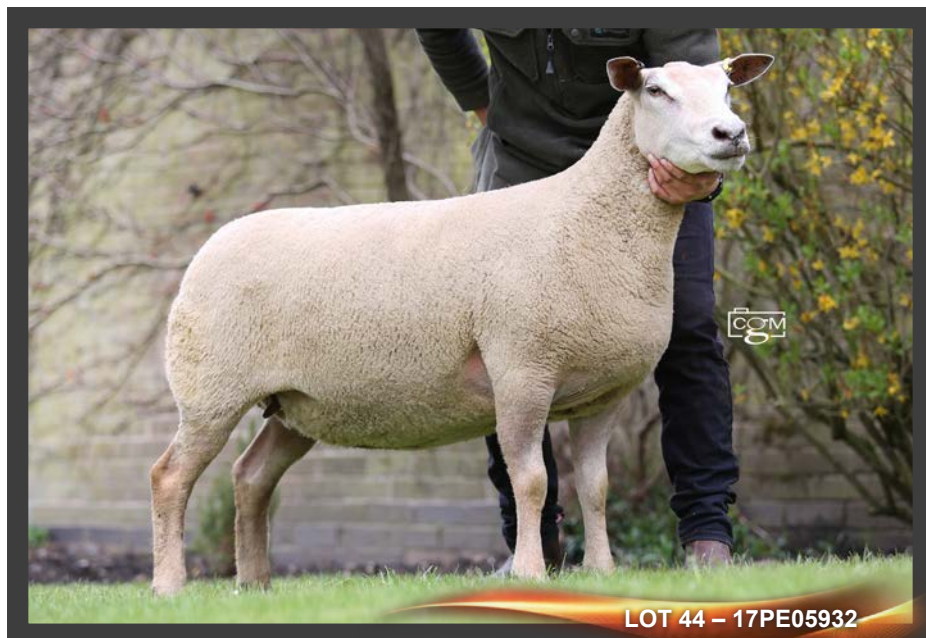
LOT 44 - 17PE05932