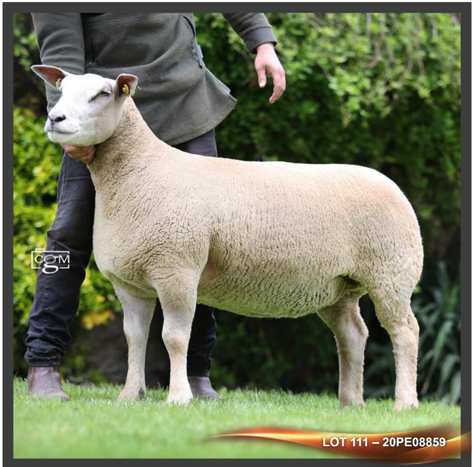
LOT 111 - 20PE08859