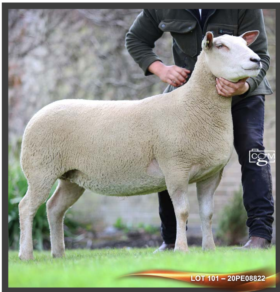
LOT 101 - 20PE08822