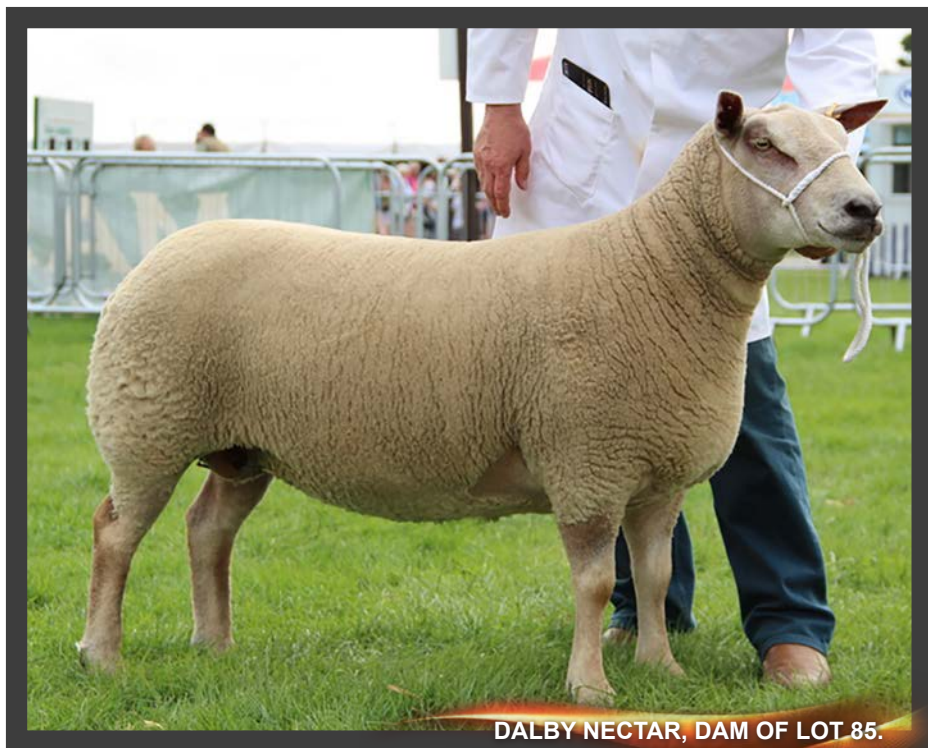
DALBY NECTAR, DAM OF LOT 85.