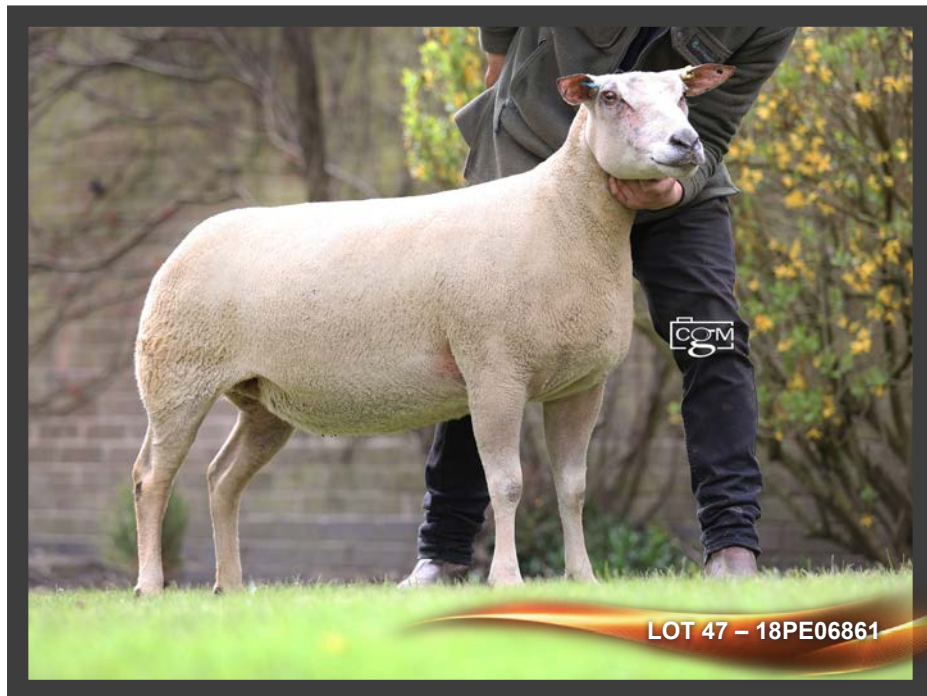
LOT 47 – 18PE06861