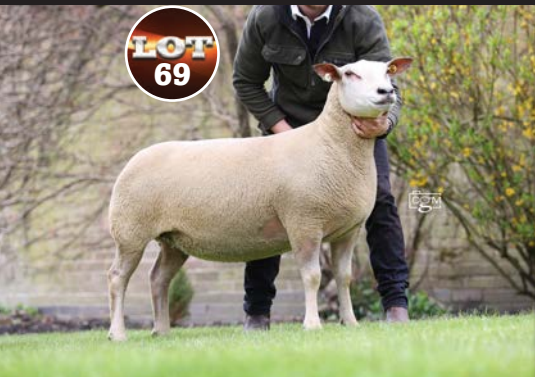
LOT 69 - 19PE07888

TWO OF HER 6 DAUGHTERS AVAILABLE IN THE SALE