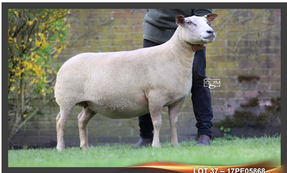
LOT 37 – 17PE05868