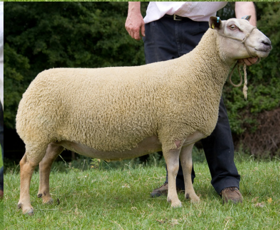
DALBY HYACINTH - PE7063