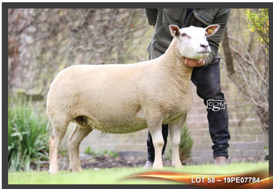
LOT 58 - 19PE07784