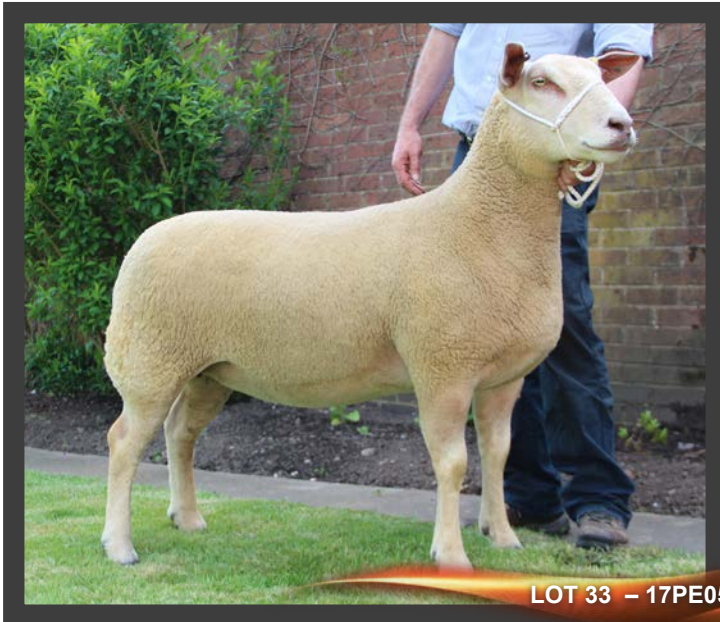
LOT 33 – 17PE05809