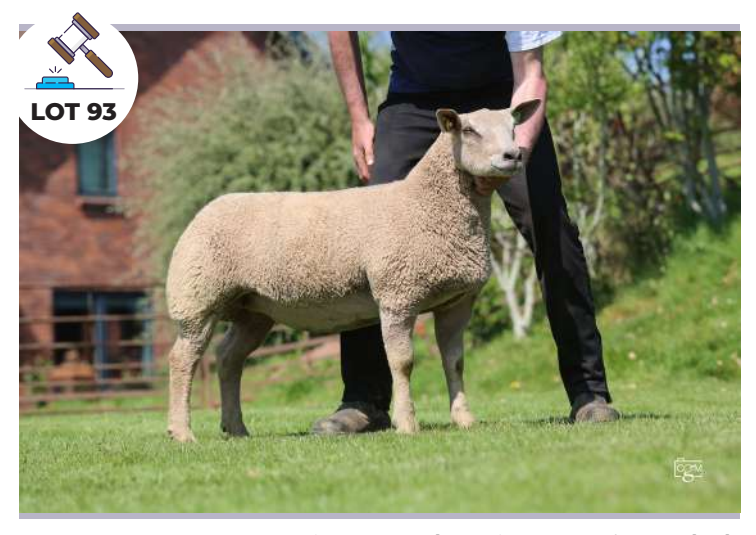
OAKCHURCH 22WKW01014 (UK0313623/01014) TWIN-ET, born 03/12/2021 Sire : Cavick What A Boy! (21WVW01210) SS: Loanhead Vanquish (20WNC32067) Dam : Oakchurch (18WKW00495) Ost Aberkinsey (1YBJ0116) Dam is Lot 6. Oakchurch (18WKW00495) Ost