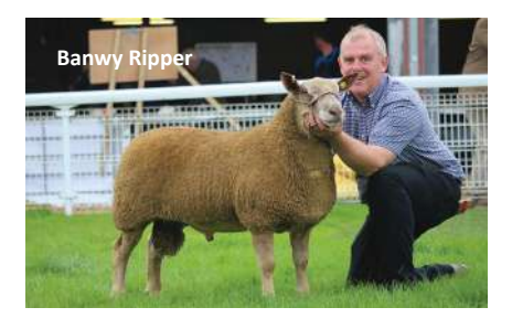
GLYN COCH MR T 12XCA00257 Sire: Oakchurch Lukasz 11WKW0003 Dam: Glyn Coch OXCA9071 Bred flashy females and yearling rams.

Sire: Aberkinsey Nitrogen 13YBJ00437 Dam: Banwy 11XXS00124 Tight skin, length, power and presence.