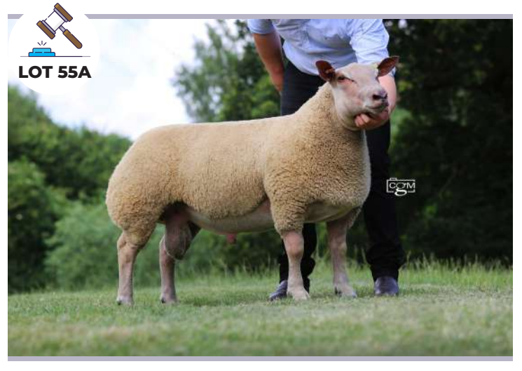
2 X EMBRYOS OUT OF OAKCHURCH 21WKW00878 Sire : Cavick What A Boy! 21WVW01210 Sire of the above embryos, Cavick What A Boy!